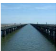
Lake Pontchartrain Causeway Safety Bay Construction, New Orleans, LA