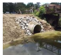
Lake Village Roadway Improvements & New 60" Drainage Piping, St. Tammany Parish, LA