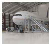
Hurricane Gustav CDBG-DR Municipal & Parish Infrastructure Programs, 53 Parishes in LA