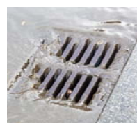
Hurricane Isaac CDBG DR Program for Drainage, Jefferson Parish, LA