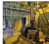
Sewerage Capital Improvement Program, Jefferson Parish, LA