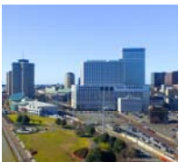
Woldenberg Park Katrina CDBG-DR Program, New Orleans, LA