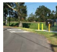
CDBG DR and Entitlement Programs for Wastewater, Jefferson Parish, LA