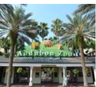
Audubon Nature Institute Capital Program, New Orleans, LA