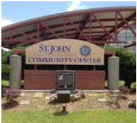
Hurricane Isaac CDBG-DR Housing Recovery Program, St. John the Baptist Parish, LA