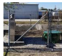
Sewer Bond Capital Program, Jefferson Parish, LA