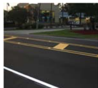
Brownswitch Road Improvements, St. Tammany Parish, LA